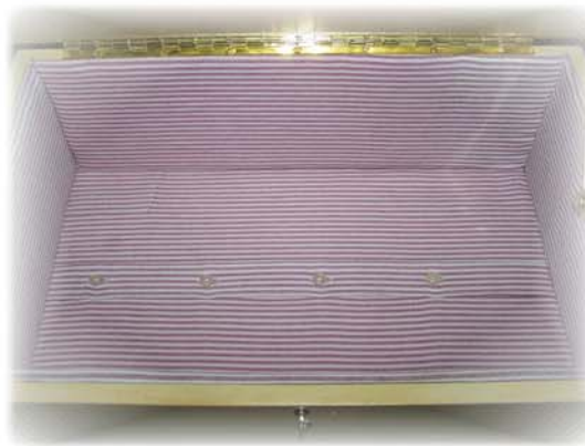
Personalized Lining - Dress Shirt

The interior is lined with your choice of material or can also be lined with personalized fabric i.e. a special shirt, blanket etc.