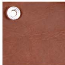
Saddle Faux Leather