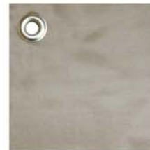
Pewter Satin Finish